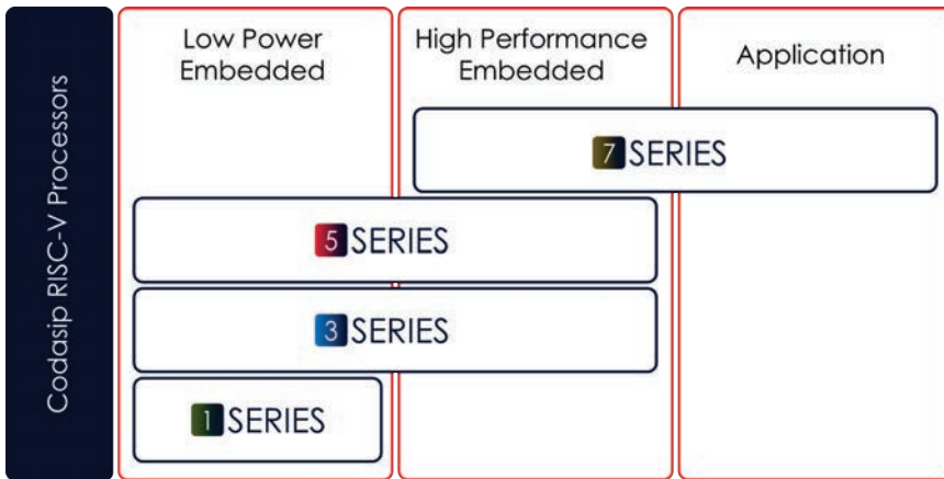
Cudasip RISC-V portfolio

Each of the domains includes multiple series based on microarchitecture complexity.